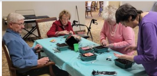
Busy working, getting ready for spring!