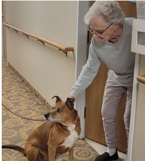
Meeting new friends every day.