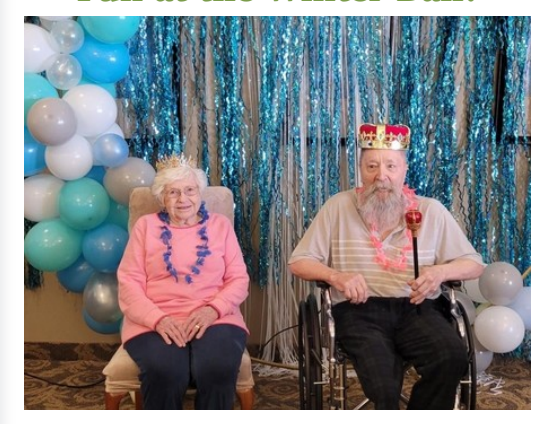
King and Queen of the Ball!