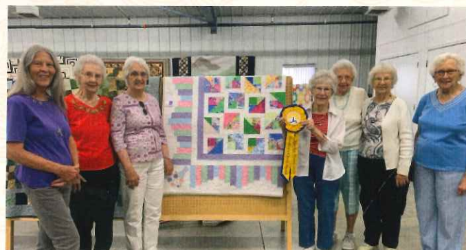
Residents enjoyed an afternoon at the Red Willow County Fair to select their favorite quilt which received a special ribbon from our community.