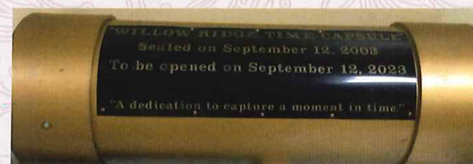
We opened our time capsule from 20 years ago on September 12th. It certainly was a trip down memory lane!